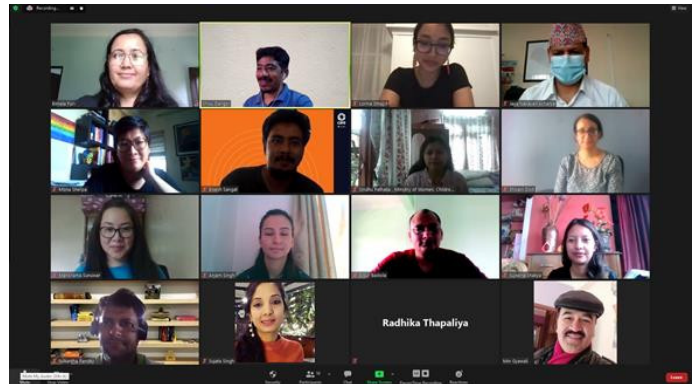
Sharing of the Rapid Gender Analysis findings with different ministries and departments of Nepal Government