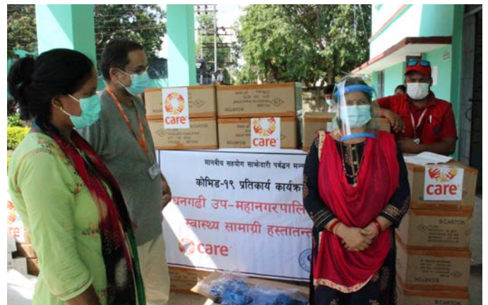
Handover of masks and face shields to Dhangadi Sub-metropolitan city