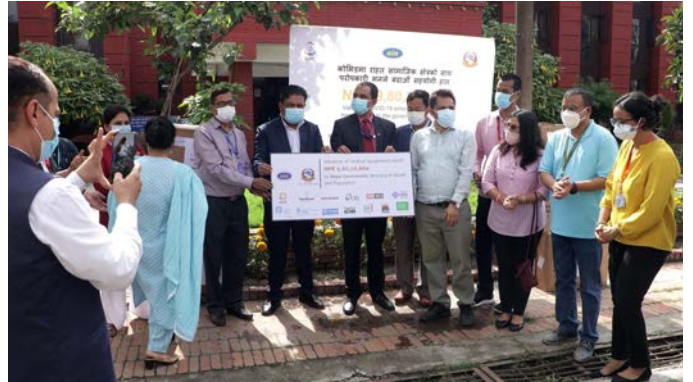
Joint handover of health equipment to the Ministry of Health and Population by INGOs, led by CARE