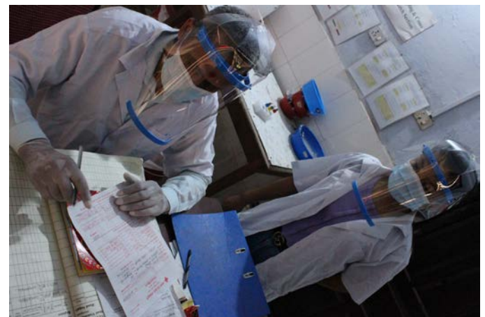
CARE Nepal delivered 200 faceshields to Red Cross Society in Kailali District

The vaccination awareness campaign run by CARE resulted in high coverage of the vaccine in Thakurbaba Municipality, 93.84% (out of 2194 targeted, 2050 got the vaccination). Likewise, in Bhajani more than 80% (1,740) of senior citizens received the vaccine during the campaign.