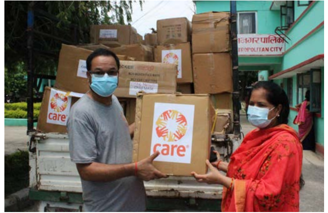
75,000 masks delivered to Dhangadi Sub-metropolitan City to support the mask campaign