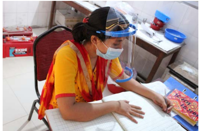
Front liners in CARE distributed faceshields providing their services.