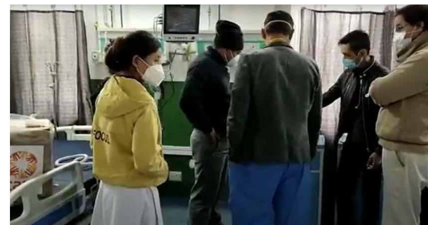
Health professionals being oriented on use of health equipment delivered by CARE Nepal