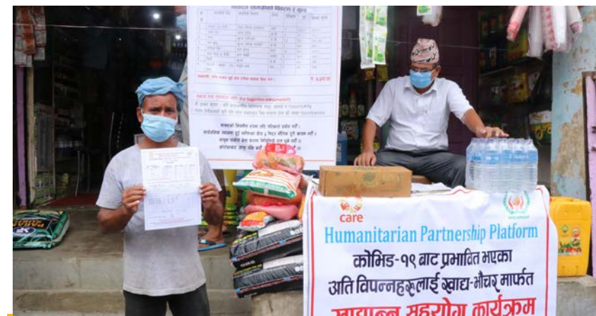
Commodity voucher assistance to food deprived households in Banke

100 Households in Banke were supported with necessary food items through commodity vouchers